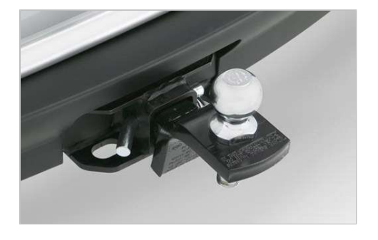
Towing Hitch Ball 2" - 6,000 lbs

High-performance LED Fog Lights enhance visibility and peace of mind in bad weather and darkness. The kit provides brighter light with higher lumen output, as well as an extra wide coverage angle for increased visibility of vehicle surroundings.