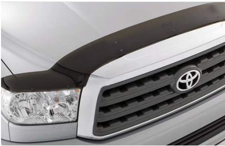
Hood Deflector $236.77

Made from thick high-grade tinted acrylic, the Hood Deflector offers high impact resistance and reduces the potential damage to your hood from road debris. The stylish wraparound design complements the vehicle's appearance while providing extra side protection.