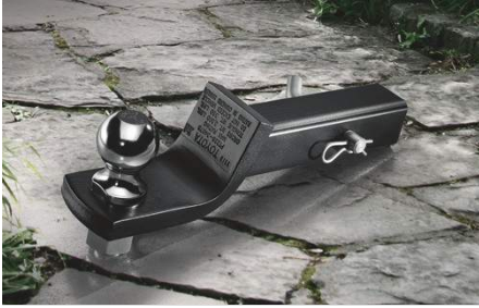
Trailer Ball - 2 5/16 $59.35

The Towing Hitch Ball is designed and tested to meet your Sequoia's towing specification and quality standards.