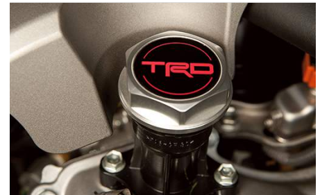
TRD Forged Aluminum Oil Cap $87.35

The Towing Hitch Ball is designed and tested to meet your Sequoia's towing specification and quality standards.