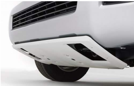
Skid Plate $546.77

Guard your vehicle from weathering, UV radiation and road debris that can chip and scratch the finish with 3M Pro Series Genuine Toyota Paint Protection Film. This durable and nearly invisible thermoplastic urethane is designed to protect the hood and front fenders to maintain a like-new appearance.