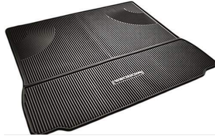
Cargo Liner $142.35

The Towing Hitch Ball is designed and tested to meet your Sequoia's towing specification and quality standards.