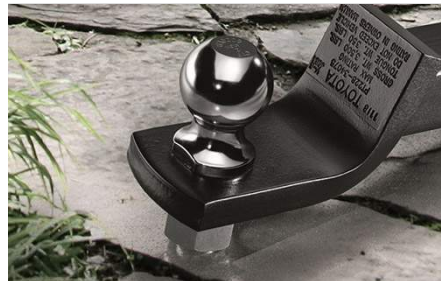
Trailer Ball - 2" $34.35

These eye-catching door sill protectors are made of durable, skid resistant material. They help prevent door sill scuffs and scratches and feature a stylish logo that provides a welcoming interior. Kit of 4 (front and rear).