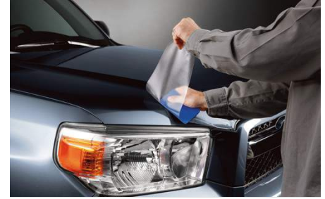
Pro Series Paint Protection Film $448.54

The Cargo Liner provides long-lasting cargo area protection. Uniquely designed and custom fitted to the Sequoia cargo floor, the liner is made of tough, easy-to-clean material that features an embossed Sequoia logo. The skid-resistant surface helps keep items in place while on the road.