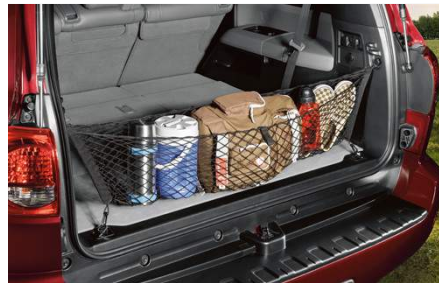
Cargo Net $67.35

The aluminum skid plate is not only stylish, but functional as it helps to protect the underbody by guiding rocks and debris away.