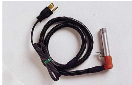
Block Heater $273.54

Made from thick high-grade tinted acrylic, the Hood Deflector offers high impact resistance and reduces the potential damage to your hood from road debris. The stylish wraparound design complements the vehicle's appearance while providing extra side protection.