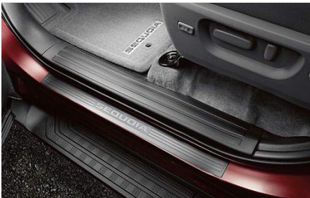
Kit: Door Sill Protectors (front and rear) $141.77

Pre-oiled and ready to install. Washable and reusable. This exact drop-in replacement filter will last the life of the vehicle, provide unrivalled engine protection and increase air flow.